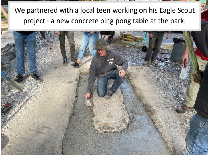
We partnered with a local teen working on his Eagle Scout project - a new concrete ping pong table at the park.