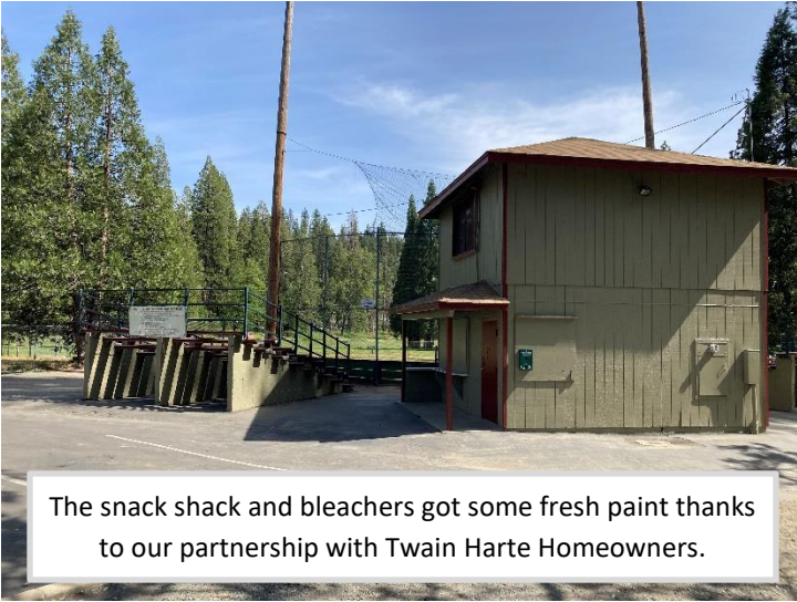
The snack shack and bleachers got some fresh paint thanks to our partnership with Twain Harte Homeowners.