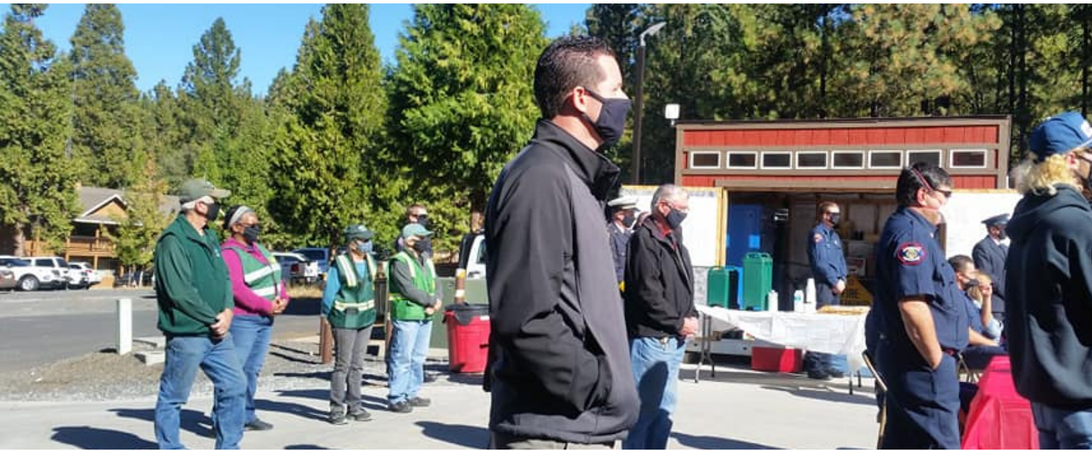
THA-CERT members and representatives of several fire agencies watch the pinning ceremony