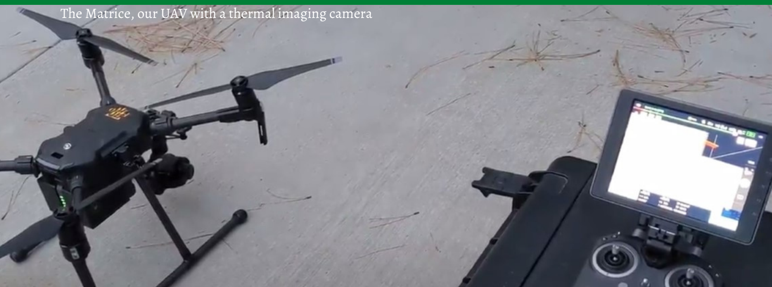
The Matrice, our UAV with a thermal imaging camera

There is still much we need to do, but the future is bright and we are looking forward to working together and developing this new relationship!