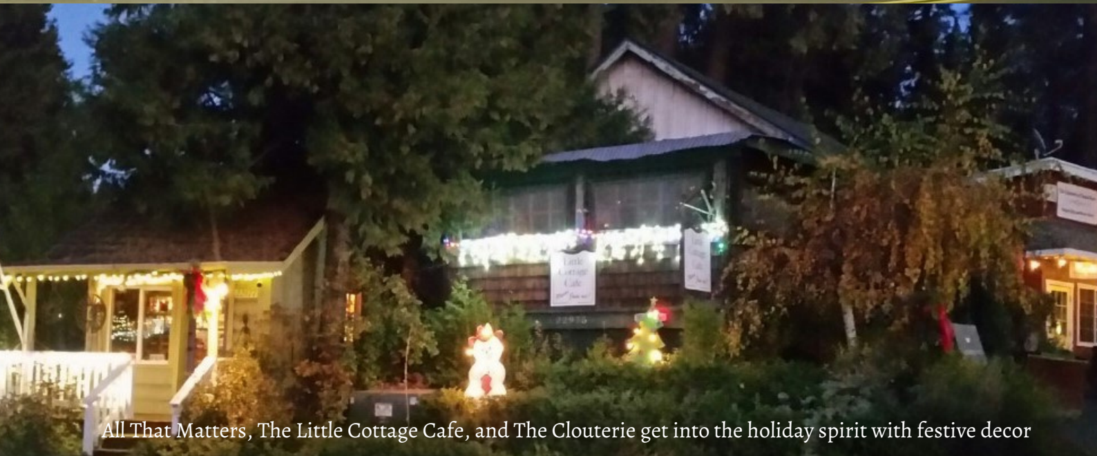
All That Matters, The Little Cottage Cafe, and The Clouterie get into the holiday spirit with festive decor