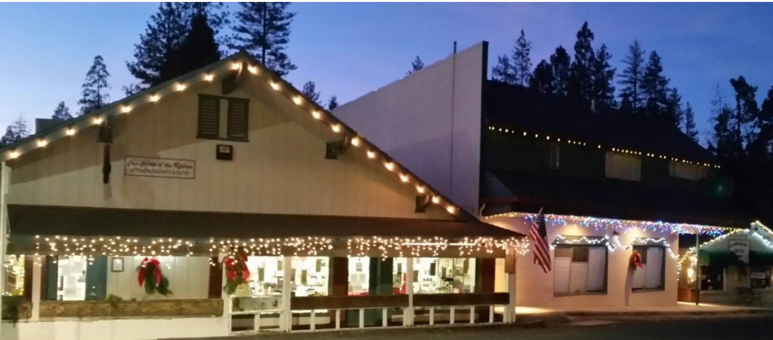
The Harte of the Kitchen, China House, and the Sportsman all sparkle in downtown Twain Harte