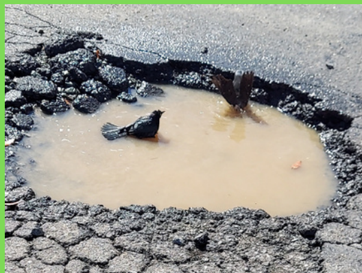
To some a pothole to others a hot tub. Always look for the beauty in life!

We hope you enjoy this month's issue. Our goal is to provide information to the community, focusing on safety and health. If you have a suggestion for future articles, please contact twainhartecert@gmail.com for consideration of the topic by the board.