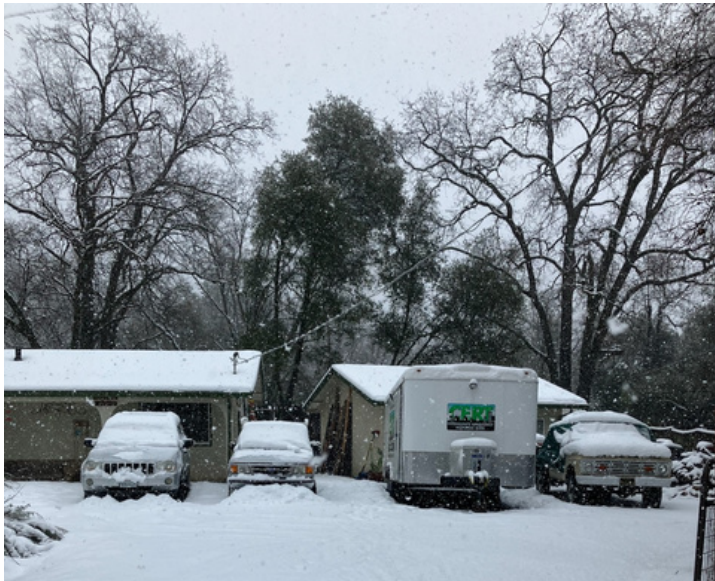
Snow in Soulsbyville

The good news is that the trailer did just fine during this crazy weather and the even better news was that it was right on my property when I had to go out and shovel off the snow. We are all looking forward to the day when our storage unit can be delivered and our trailer can be converted to a mobile cooling/warming station. We still need to build a structure to protect it from the weather but it will also be easier to move around.