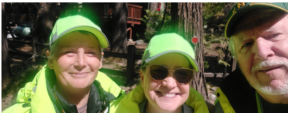
Kids at Camp or CERT volunteers, you decide

The drivers were very patient and the work went fast, it only took them 11 minutes to clear out the pipe and everything was flowing again, including traffic.