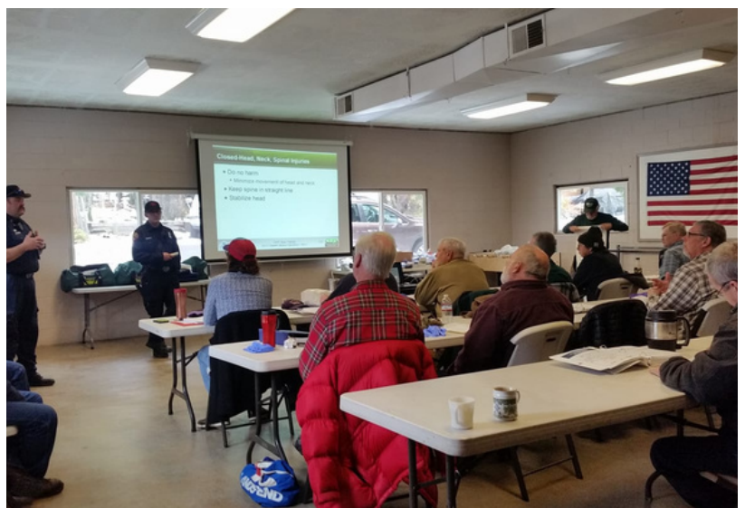
Pre-pandemic monthly meeting/training session

All are invited to the THA-CERT monthly training meeting, held the last Saturday of the month (this month's meeting is on the 29th) from 9 am to Noon in the Twain Harte Community Center Manzanita Drive, Twain Harte