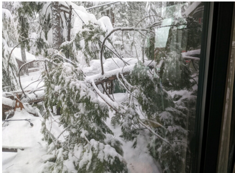
Storm damage in Twain Harte