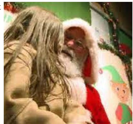
Our hero Santa

There I was standing on the side lines in my CERT hi-visibility vest ensuring that the little children, who were so enthralled with the sight of Santa, did not get over anxious and end up getting hurt. I looked up into the brightly lit sleigh and who was looking down at me? Santa! He winked and blew me a kiss. I immediately transformed into a 5 year old little girl who felt the magic of Christmas well up in my heart as one of my heroes went by with a wave.