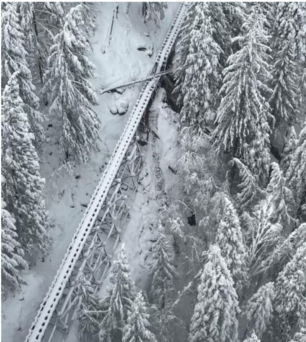
Aerial view of the damage to the main Tuolumne ditch