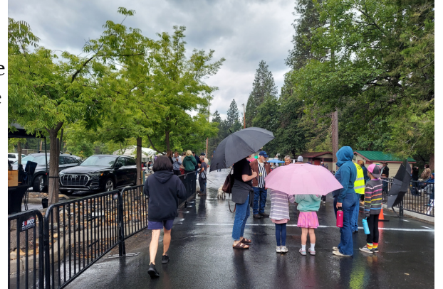
Spectators arriving under gray skies