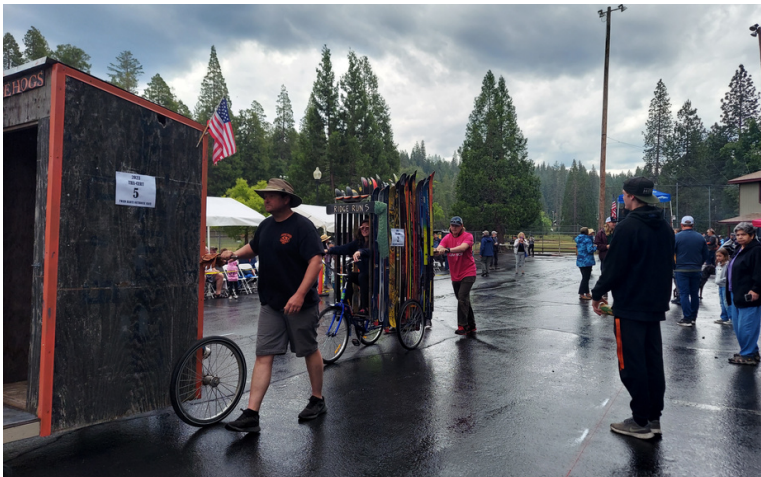
Parading the outhouses

We could hear thunder as the huge rain drops came down, again no one seemed to mind. So we started the parade. The race carts were amazing, all unique in their own way and yet had the same criteria to race... it had to be an outhouse.