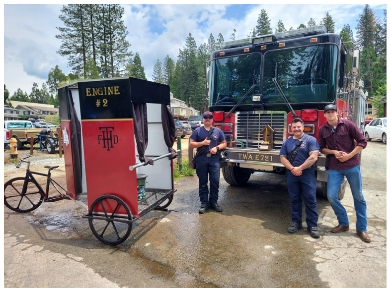
THFD winners of the "Golden Plunger Award"