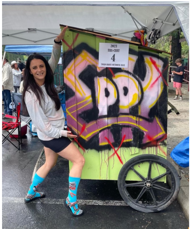
Second Place: Eppy House from Twain Harte, CA