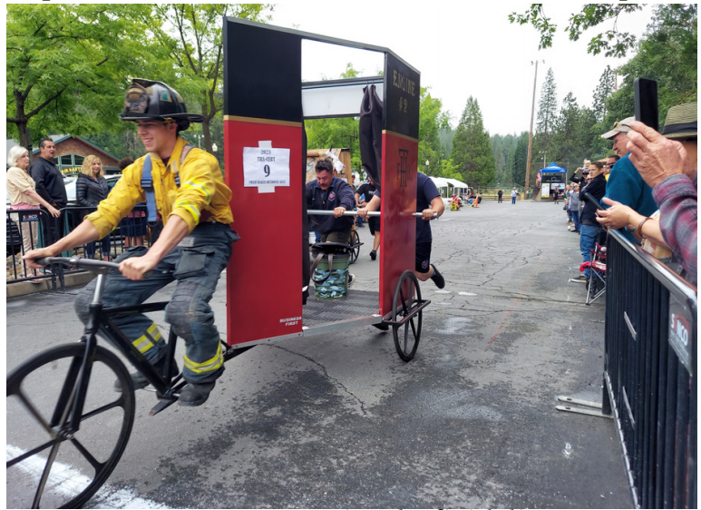
THFD crossing the finish line

The big kids were not the only ones that raced that day... we also had the "Tot Pot" races. The young kids were so adorable and took the race as seriously as the older kids (adults). It was so much fun to see the joy on everyone's faces.