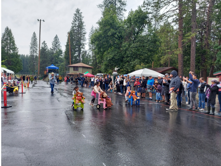
Tot Pot Races

The teams were lined up against one another and off they ran at full speed until after they crossed the finish line. It was exhilarating watching the speed they could get going. And I am sure the drivers felt the same way.