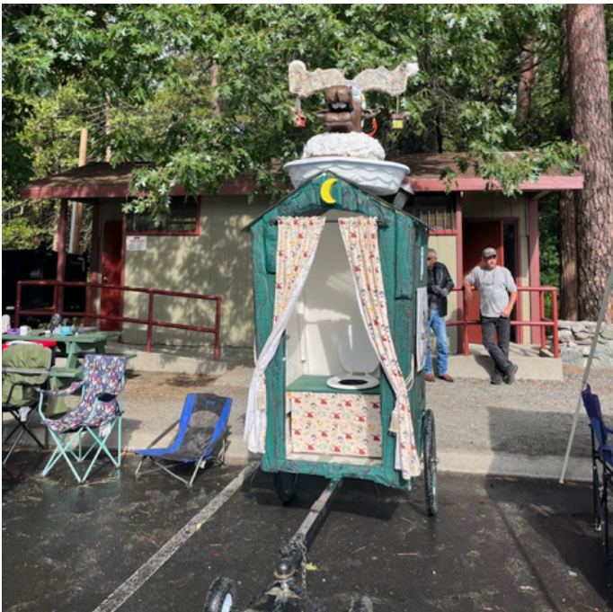
People's Choice: Moose Turd