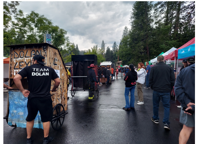
Dolan Team from Reno in the parade

The CERT volunteers worked hard to get the event started. Directing people, blow drying the track so we can stripe the lines, registering the racers. It was a mad dash to the start but they took it all in stride. MYACT (Mountain Youth & Community Theater) was there to sing the National Anthem.