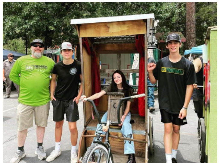
Turd Place: Ace in the Hole from Reno NV