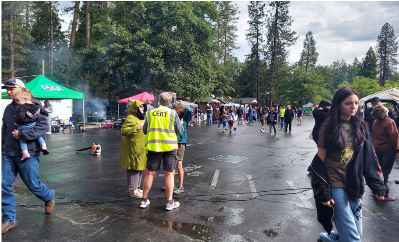
Lets get this party started!

The rain came down but people did not seem to care they came anyway. The colorful umbrellas made the event even more magical.