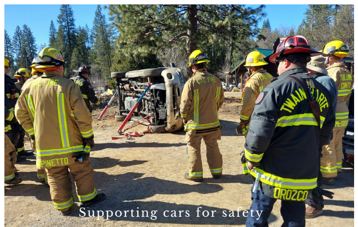
Supporting cars for safety

Many of the THA-CERT members were able to come by and learned even more about how Firefighters work to save lives.