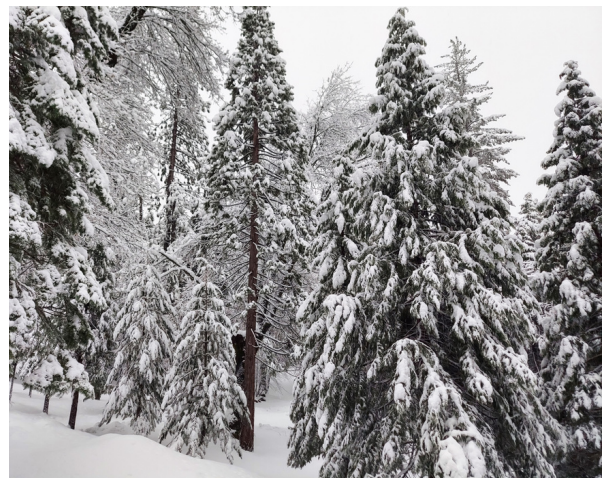
Looking out my window as I write this article

Share what is happening around you? The training has been reschedule for March 25, and I hope you plan to attend. We will show you how to keep in touch.