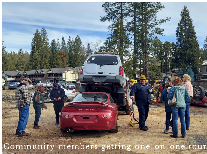
Community members getting one-on-one tour

As a Fire Chief of a small department, I was amazed by the community involvement, and I appreciate the one-on-one face time with the public. They were able to get a front-row seat to what truly happens during technical rescue vehicle accidents.