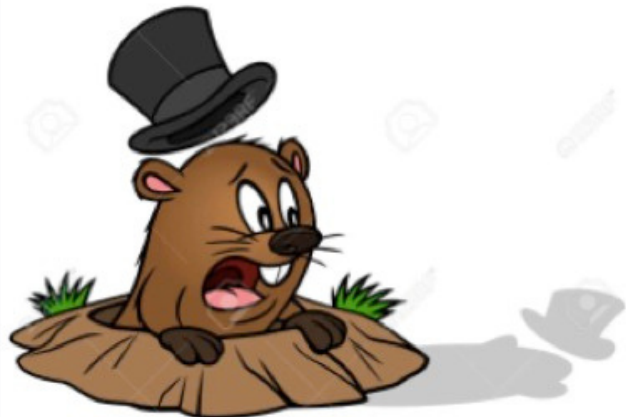
Oh yeah, I see my shadow!