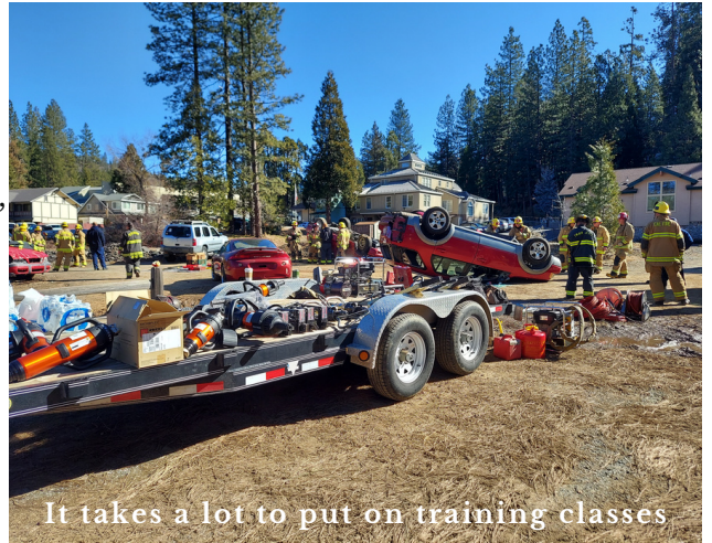
It takes a lot to put on training classes

Special thanks to the Twain Harte community,