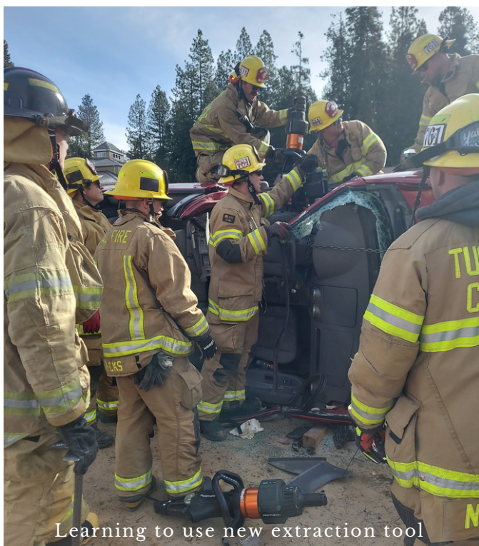
Learning to use new extraction tool