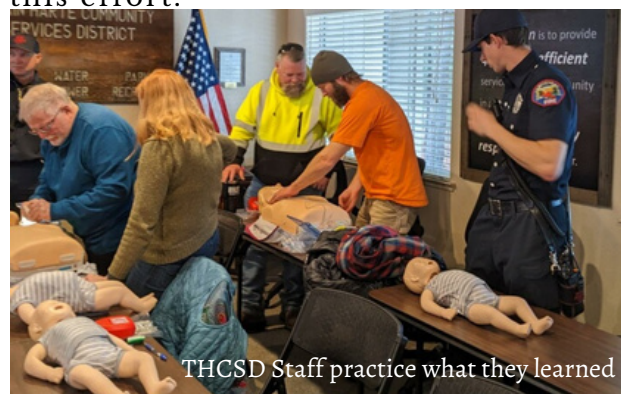
THCS D Staff practice what they learned

I want to commend the THFD for their forward-thinking and their efforts to make our little community safer. All three of us were honored to be a part of this effort.