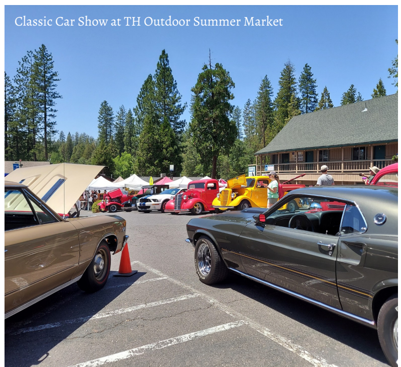
Classic Car Show at TH Outdoor Summer Market