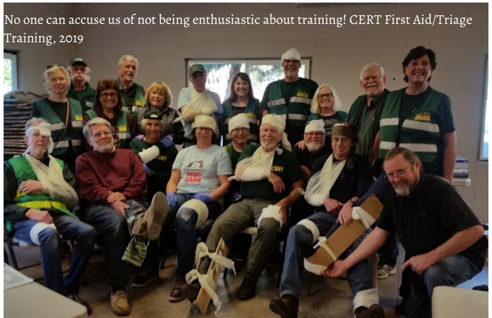
No one can accuse us of not being enthusiastic about training! CERT First Aid/Triage Training, 2019

Today, I am able to call a couple of key staff members, let them know what I would like to do for the community and they execute...it is a beautiful thing to see. Thank you to each and every CERT volunteer, you make me proud!