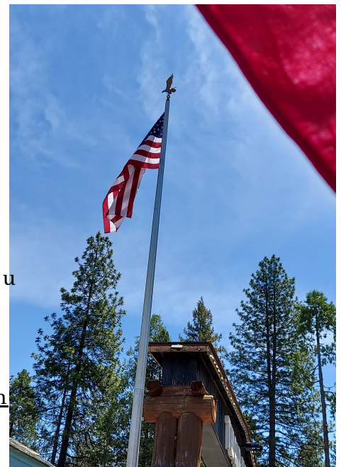
(Above) The flag at the Arch in Twain Hart on 4th of July

We hope you enjoy this month's issue. Our goal is to provide information to the community, focusing on safety and health. If you have a suggestion for future articles, please contact twainhartecert@gmail.com for consideration of the topic by the board.