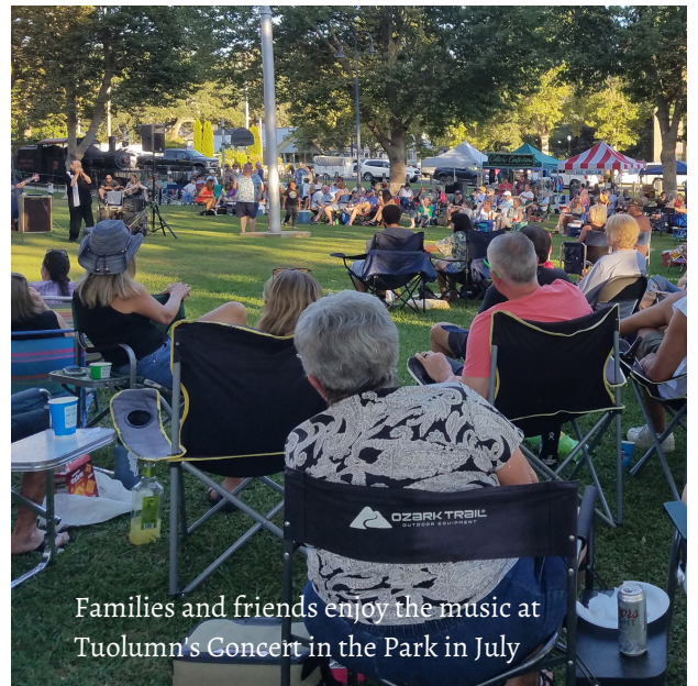
Families and friends enjoy the music at Tuolumne's Concert in the Park in July

Music, art, open air market, and food booths