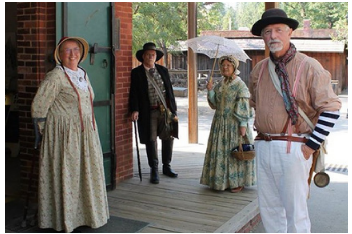
Gold Rush Days at Columbia SHP

Feb 26, Saturday - CERT Basic Training Class Unit 1 & 2 - Disaster Preparedness & CERT organization Groveland 9am-1pm