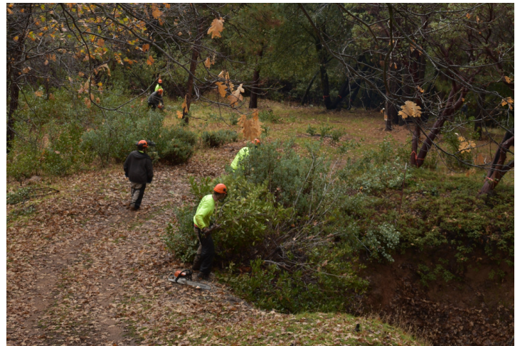
Crews clear brush from around a large "glory hole" on our land

Before the crews started, Steve pointed out that any trees that were growing in clumps would be thinned to safer numbers, and any small trees close to established trees would be cut down. He gave us tape to mark any of the smaller trees that we specifically did not