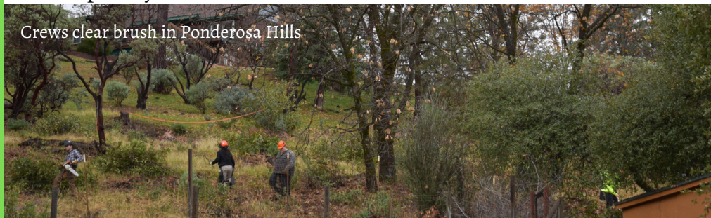
Crews clear brush in Ponderosa Hills

If you have a suggestion for future articles, please contact twainhartecert@gmail.com for consideration of the topic by the board.