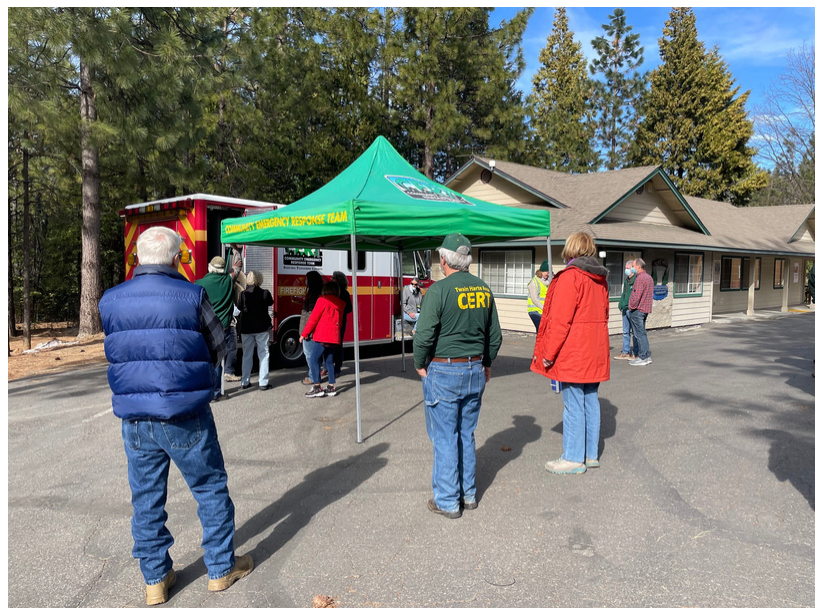
(Right) CERT members practice setting up the "intake" area for Firefighter Rehab training