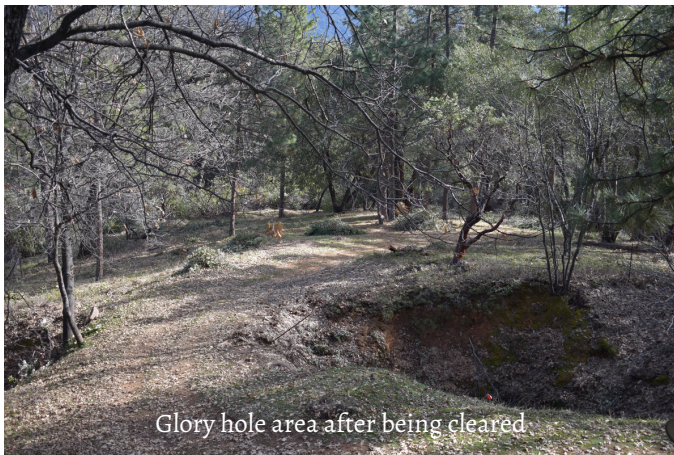
Glory hole area after being cleared

We had been clearing brush on our property for years, expanding the defensible space around our house to a significant distance beyond the minimum required. Over time shrubs grow back, so the crew of about 10 young men and women, went to work with hand and power tools. In two days, they accomplished what would have taken my husband and me several weeks to finish.