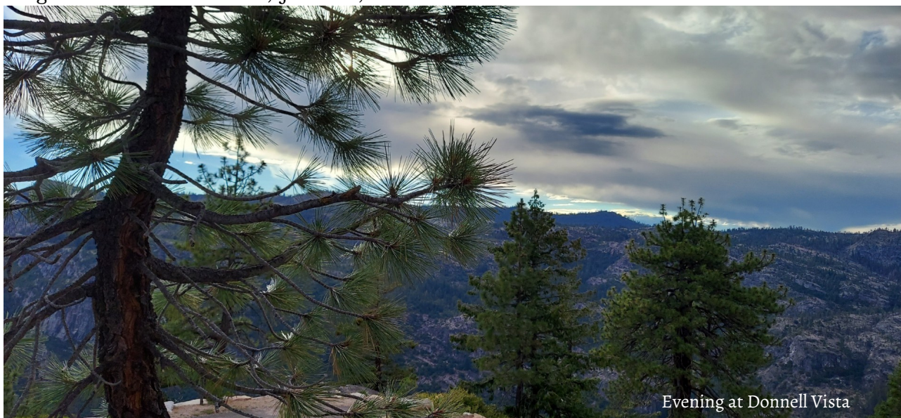
Evening at Donnell Vista

HOT trainings: We had two HOT trainings this month, the Nugget and the CERT hands on training...you will read more about them in the newsletter. Let me just remind you that the CERT trainings have restarted. We do them the last Saturday of the month and they are open to everyone. The idea is to train our community to be more prepared when a disaster happens. We will post information in the newsletter about our trainings. You are welcome, join us, it is a HOT time!