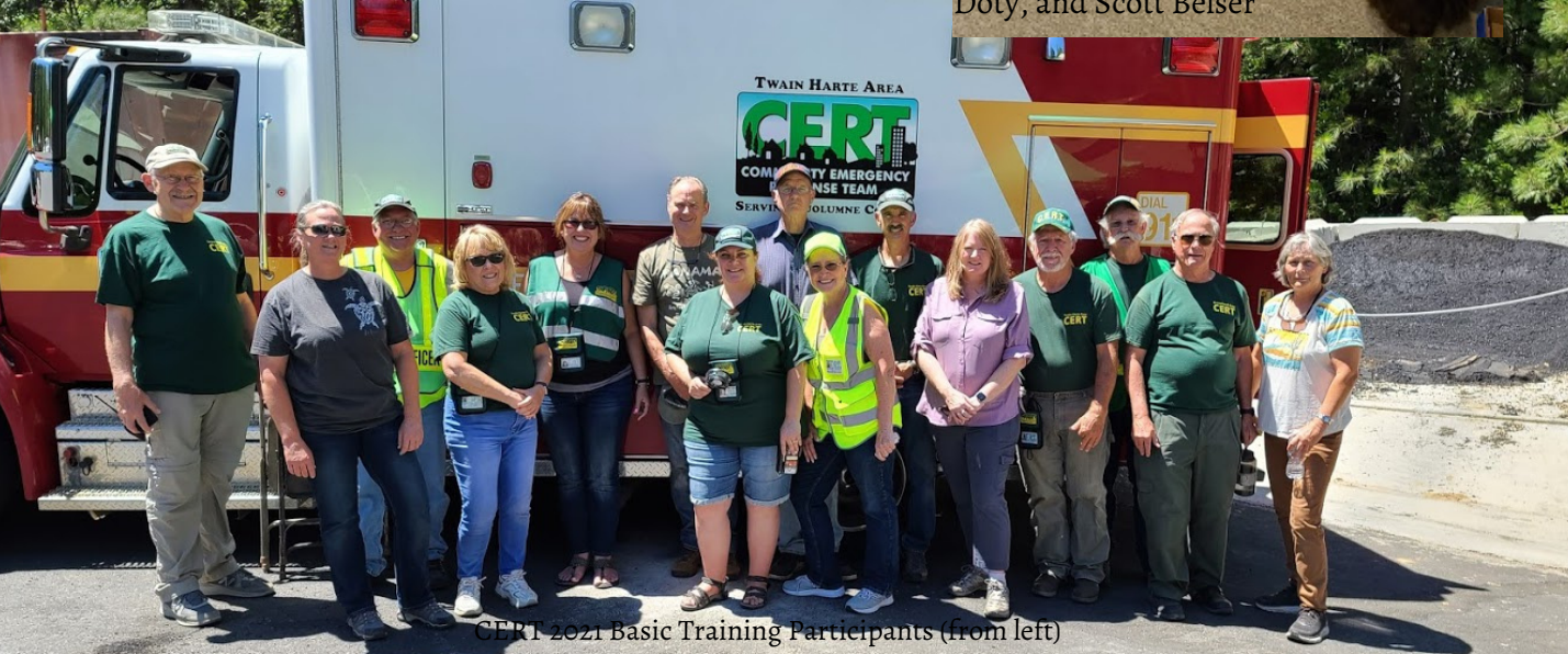
CERT 2021 Basic Training Participants (from left)