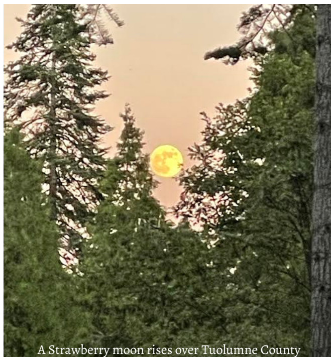
A Strawberry moon rises over Tuolumne County

HOT celestial skies: To escape the heat four of us went up to the Donnell lookout and enjoyed a picnic dinner. The view from our picnic table was spectacular. The winds were cool and the skies were gray and moist. Believe it or not this was a June evening! We had a feeling that if we stayed one more minute we would get soaked so we packed up and hiked back to the car. On the way down the hill we were hoping to get a glimpse of the Strawberry Moon...it seemed like maybe we were not going to see it when all of a sudden there it was! We stopped on the side of the road to take a few pictures. The motto for that night was: Good friends, good food, good memories and it was a HOT time!