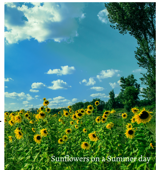
Sunflowers on a Summer day

We hope you enjoy this month's issue. Our goal is to provide information to the community, focusing on safety and health. If you have a suggestion for future articles, please contact twainhartecert@gmail.com for consideration of the topic by the board.