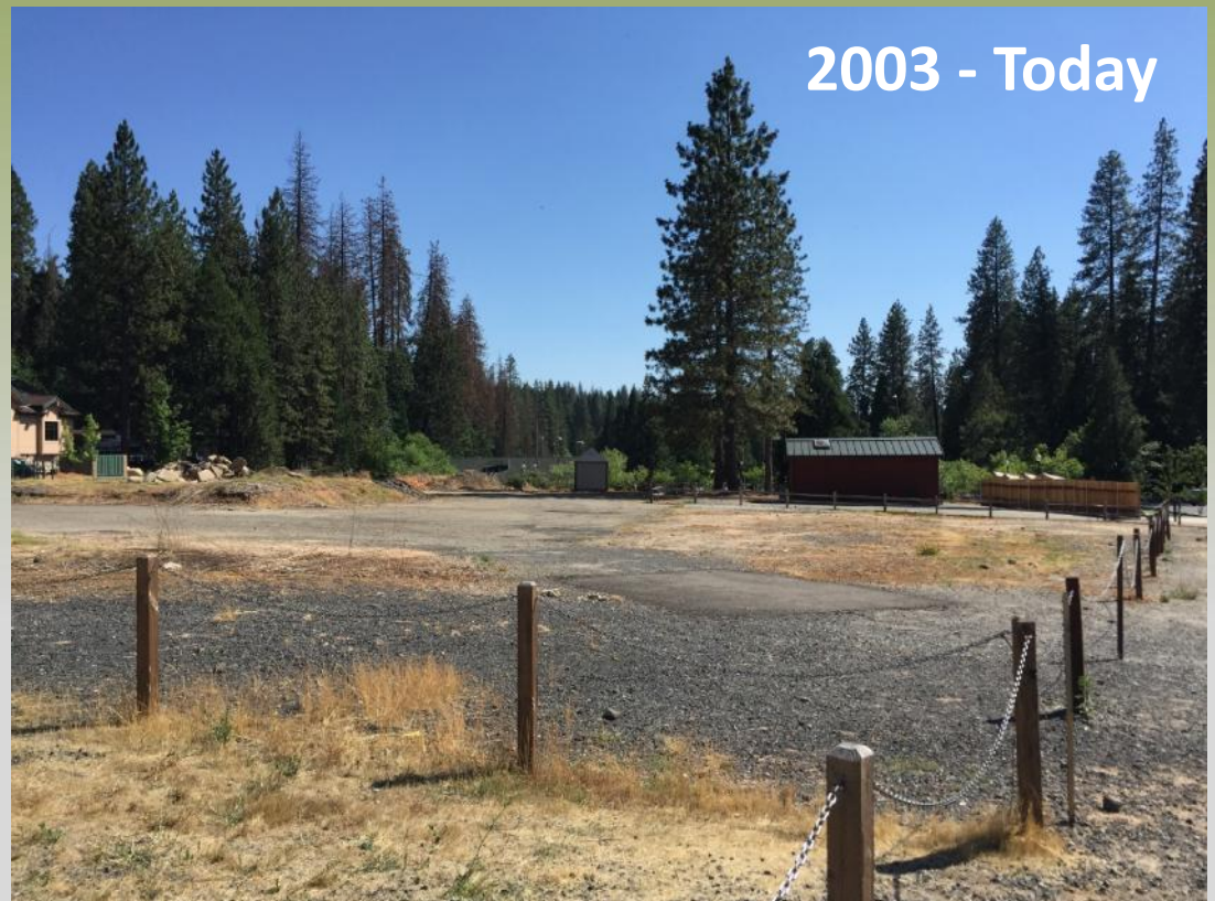
2003 - Today