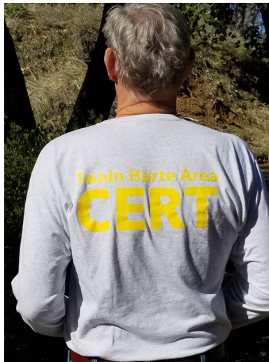
Front and back of new dress shirt