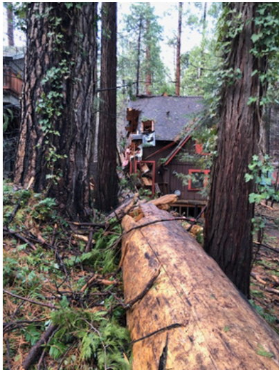
Storm damage in Twain Harte

On January 4th, we had a request to have members on call over night just in case we needed to do evacuations and/or wellness checks. We had 3 people available around the clock for three days. Luckily we were not called.