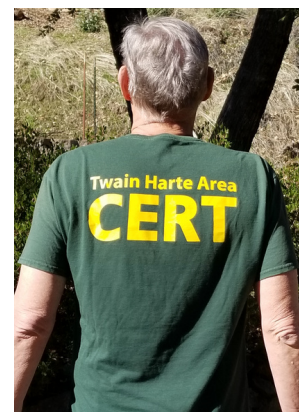
Front and back of classic green "work" CERT shirt