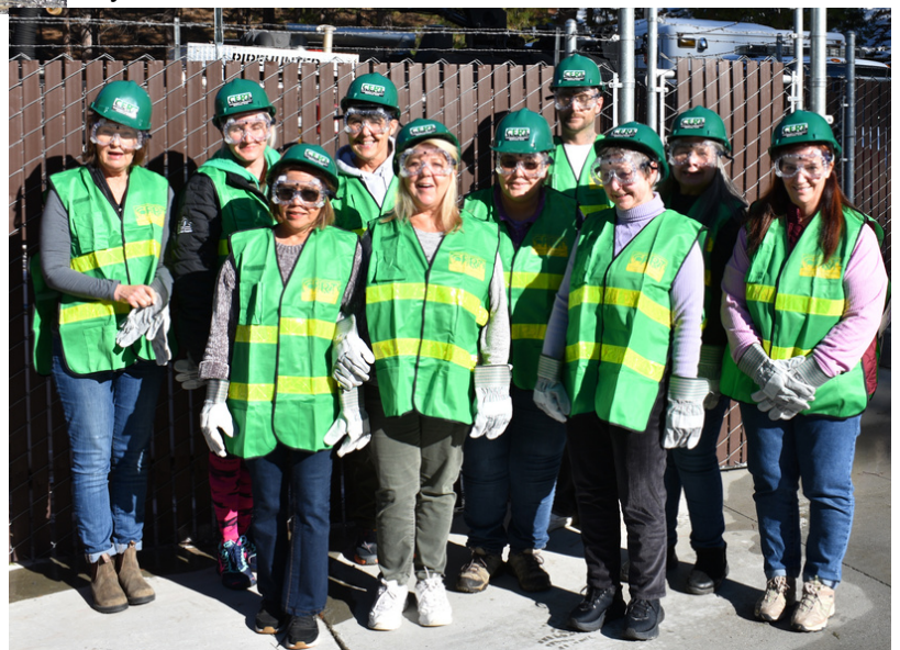
Our fearless students, all geared up and ready to extinguish some fires