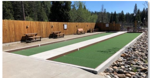
Bocce courts and proposed improvements