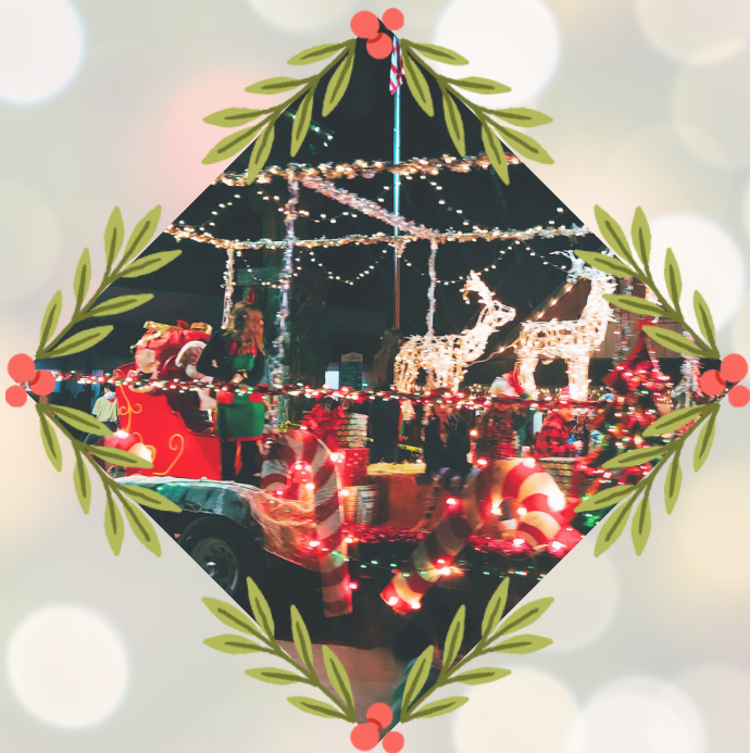
Santa and Mrs Claus arriving in style