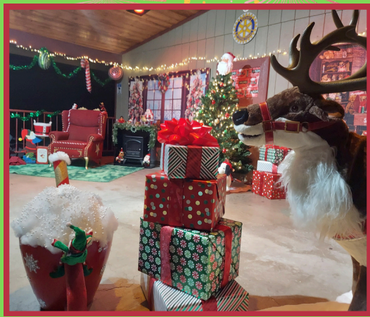
Santa's workshop in Twain Harte