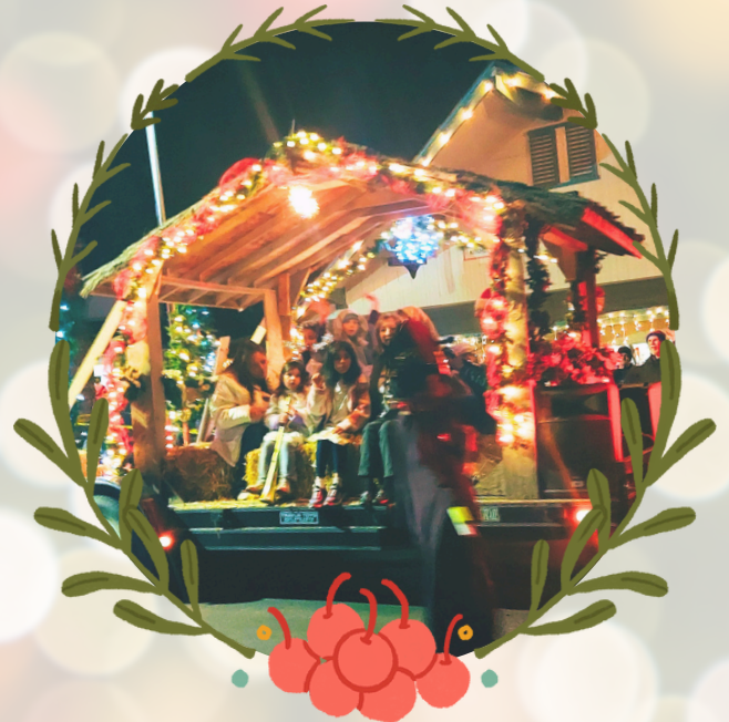
Over 40 entries lit up Twain Harte