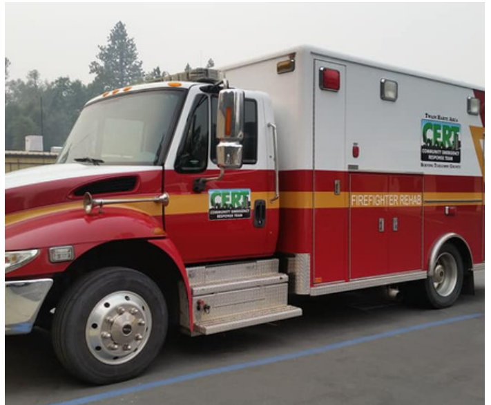
Two of our "fleet"...the CERT Truck and the Fire Fighter Rehab vehicle. Not pictured is our CERT trailer