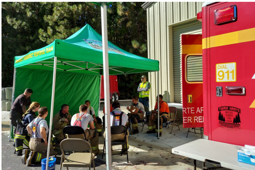
A group of students receive some additional training in the "recovery tent", behind the Firefighter Rehab vehicle

We had 25 students go through the training during our 9-hour day. We had 12 THA-CERT volunteers on site. We had 2 of the Academy Students inquire about the CERT program and almost everyone thanked us for being there. It was so nice to see such caring, wonderful young people who, at some point will be out there responding to our calls for help. It really feels good to be part of their training!