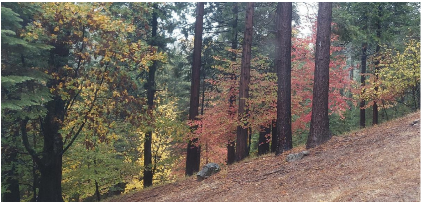
Autumn colors in Twain Harte

Enjoy the fall colors, the crispness in the air that depicts the end of summer and the entrance into winter.